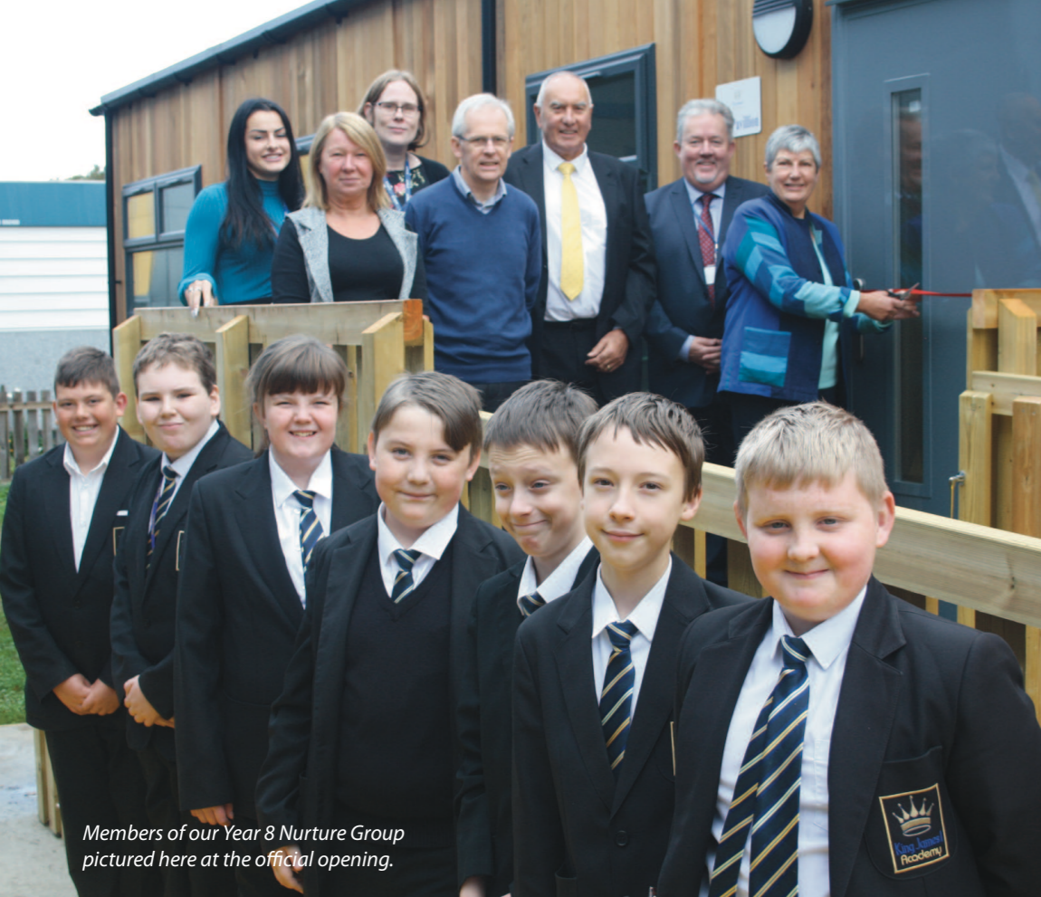
Members of our Year 8 Nurture Group pictured here at the official opening.